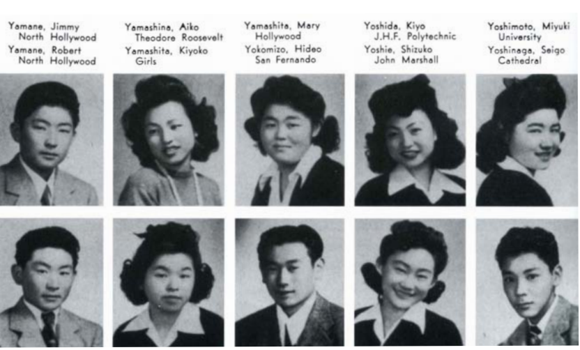
Reprinted in the "Our World", Manzanar HS yearbook, 1944 with permission from Toyo Miyatake, Inc.

The first few pages of montage photos seem pretty ordinary for an old yearbook, teachers posing in front of blackboards, students behind lab tables sporting chemistry apparatus, girls at student events in sweaters and bobby sox. The first things that really rock readers are the senior pictures. Of course, we know the seniors are all Japanese. What we do not think about until we read the captions under the graduates names is that they all should be graduating from some other, normal California high school. Each name is accompanied by the name of the high school that student would have graduated from if he or she had not been imprisoned—"North Hollywood, San Pedro, Van Nuys, Santa Monica, Herbert Hoover, Theodore Roosevelt, Thomas Jefferson, John Marshall, Venice, San Fernando." These are all young Americans who just happen to be of Japanese ancestry. It's a yearbook, an American school yearbook, just like the ones your students want their parents to buy for them this year. There are sections and pictures for