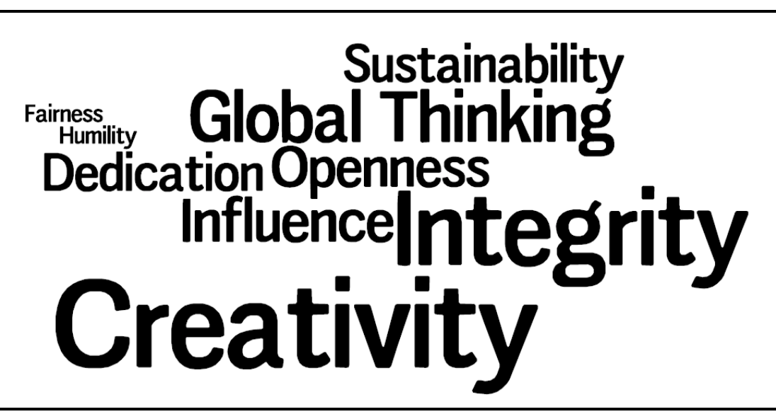
Figure 1: Word cloud with top leadership qualities CEOs cited as most important

Given the importance of innovation for new business growth, the theory of innovation can and should be taught to technology students. One such example of innovation theory is that of disruptive innovation. A disruptive innovation creates a new market by applying a different set of values, which ultimately (and unexpectedly) overtakes an existing market (Christensen, 1997). The examination of Netflix's role in the video movie rental market provides a simplified case of disruptive innovation. Netflix is a service that allows customers to stream movie content to any web-based device on demand, thus eliminating the need for customers to drive to video rental stores and choose from in-stock movie title options. Using a customer-focused and low-cost business model, Netflix disrupted the traditional business model of competitors such as Blockbuster. Disruptive innovation theory explains how new companies can utilize "relatively simple, convenient, low-cost innovations to create growth and triumph over