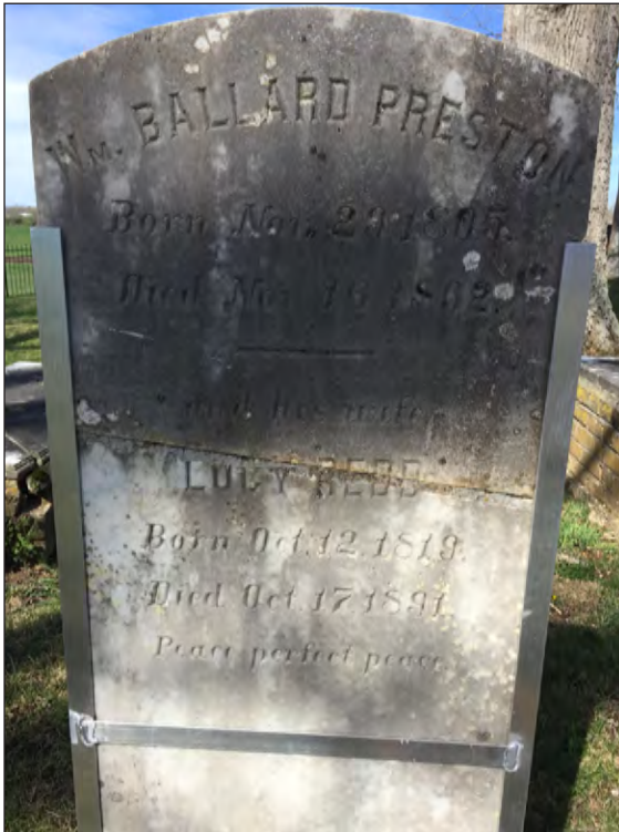
Gravestone of William Ballard Preston in the Preston cemetery

Ballard had closed his remarks at the Virginia Secession Convention in March of the preceding year with an appeal for all to stand with the commonwealth and “to vindicate every right that belongs to her.” He noted how his ancestors had fought and died in her defense, adding that should he “fall elsewhere,” he wanted to be returned to the “consecrated earth of my mother Virginia” for burial in his own meadow. Then it could be said, he added, that “[a]fter life’s fitful fever, he sleeps well.” He was, indeed, buried in his own meadow at Smithfield, but it probably is not conjecture that Ballard died a stressed, conflicted man over the issue of slavery and his