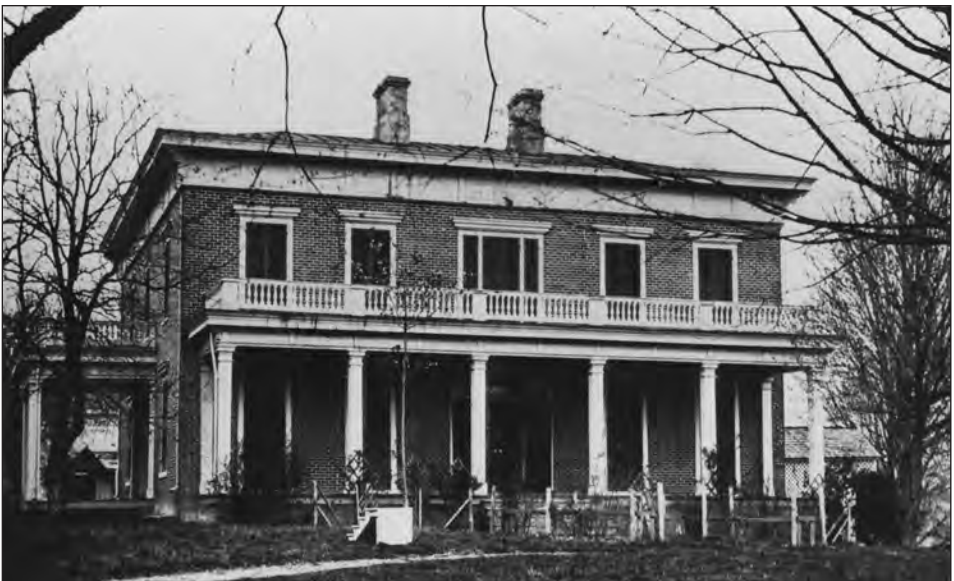
White Thorn, 1898

The Preston brothers’ success was due in large part to the labor of enslaved people—most of them had been inherited from Governor