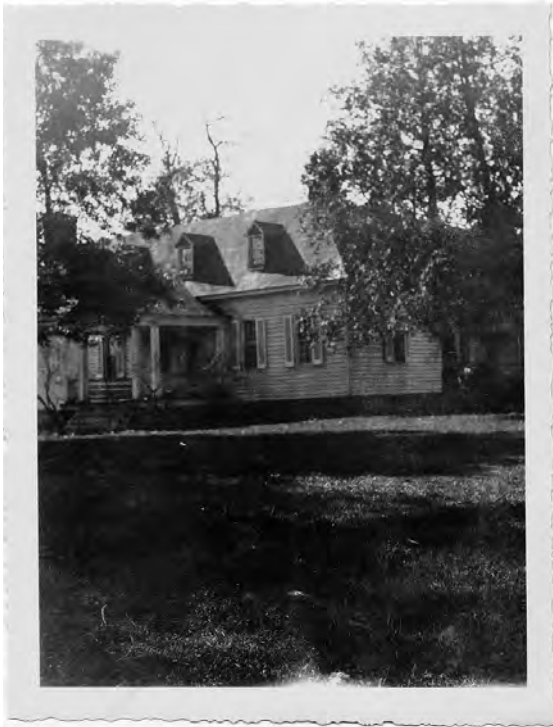
Smithfield manor house, c. 1900