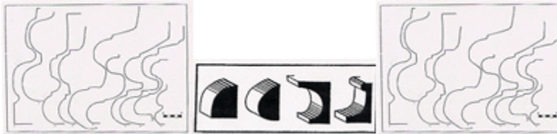
Center: several types of mouldings; right and left: variations on Roman Ionic mouldings from Etruscan and Republican Roman Mouldings , 1965.

her work as a scholar and teacher. She says she "can't think of anything happier to spend her life on" than her work.