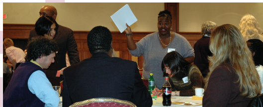
Participants in the "World Trade Game." Groups had to work together to make products with differing resources. It illustrated how powerful groups interact with groups of people who have fewer resources.

Congratulations on another successful Diversity Summit! We owe a debt of gratitude to the Commission on Equal Opportunity and Diversity for organizing a creative, energizing and authentic set of experiences and conversations on three important issues that impact our community's ability to be truly inclusive: communicating across language barriers; increasing awareness and acceptance of social, cultural, and racial differences; and, understanding the impact of economic disparity on a community's ability to thrive within the global environment. Reflecting openly on these three issues was a sobering experience for many of us. Despite the progress we have made within the university community over the past 10 years, we know there is much more to be done to properly recognize, value, and optimize the diversity among us.