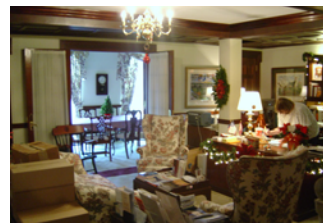
An interior office and reception area in Alumni Hall.