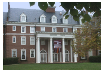
The first and second floors of Alumni Hall are the future home of the Graduate School.

Graduate students with assistantships (GA, GTA, and GRA) will receive an increased insurance benefit, effective Fall 2005. The university has committed to providing 70% coverage of the insurance premium for a single graduate student — a significant increase from the amount offered as an insurance subsidy in previous years. This coverage amount will increase to 90% within two years to further promote the Graduate School's goal of attracting and