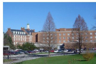
Donaldson Brown, seen here from Kent Street, will become graduate housing and a Graduate Life Center.